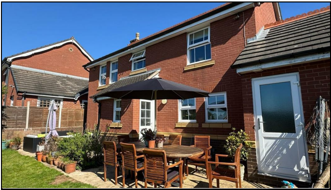
Betteridge Drive, Sutton Coldfield, B76 1FN